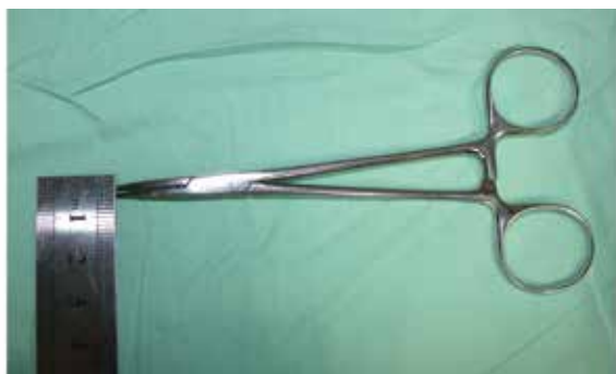
Figure 1. Modified curved 5-in. Halstead mosquito forceps. Pedal withdrawal reflexes were measured in the hindlimbs as the response to curved 5-inch Halstead mosquito forceps closure on the first level. The mosquito forceps were modified by bending one arm, thus precluding complete closure of the arms.

in the mice injected intraperitoneally, the section included the skin, subcutaneous tissue, and abdominal wall.