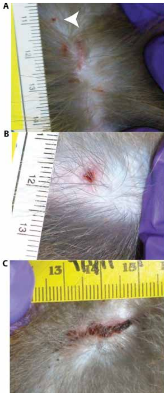
Figure 1. Images of wound-score classifications for representative wounds, including (A) superficial pinprick wounds (white arrow; score, 1), surface scratches (score, 2), (B) deep puncture (score, 3), and (C) deep laceration (score, 4). Measurements are in centimeters; panel A shows 4 scratches with scores of 2 and 1 pinprick wound with score of 1; the overall score for the area is 2.

repeated measures, we found that although the animal itself was a significant determinant of the maximal wound severity (that is, animals tended to have similar wound severities from week to week, P = 0.0139 ), neither the previous maximal severity nor the interaction between subject and previous severity was a significant factor ( P = 0.7546 and P = 0.6730 , respectively). In other words, the wound score on a given macaque during a given week was determined by the identity of the animal and not by the previous score. Furthermore, the incidence of observed SIB behavior was associated with the number of wounds ( P = 0.025 ; z score, 2.25) and their distribution ( P = 0.024 ; z score, 2.25). The