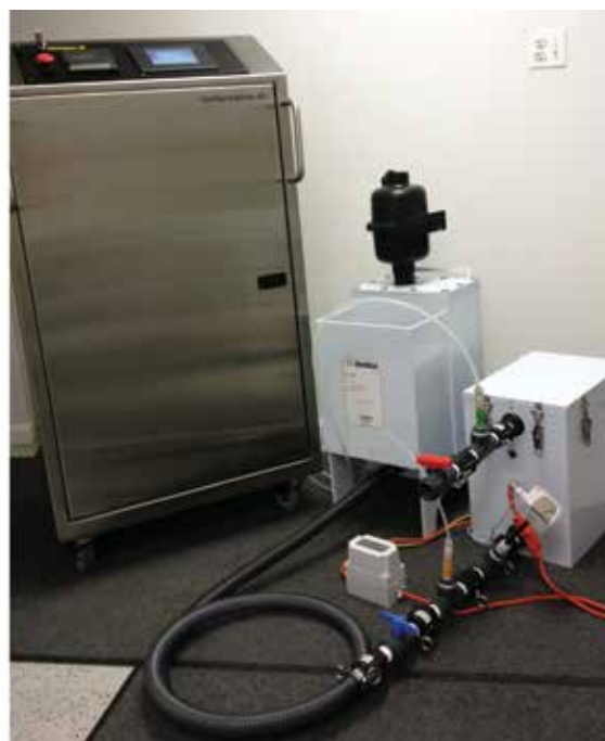
Figure 1. Decontamination equipment, using a Minidox-M Decontamination System (ClorDiSys Solutions).

Chlorine dioxide exposure. Chlorine dioxide gas (ClO 2 ) was generated by using the Minidox-M Decontamination System