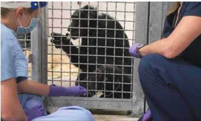
Figure 3. Chimpanzee S receiving acupuncture therapy for stifle osteoarthritis (acupuncture points from left to right: ST36, ST35, and ST34).

Chimpanzee S required 5 sessions before he was completely trained for acupuncture treatments. During the first training session, he held his position for 4 min. At the second session, he held for 6 min, and during the third and fourth sessions, he held position for 5 min each. During the fifth session, chimpanzee S held position (with needles inserted) for 10 min.