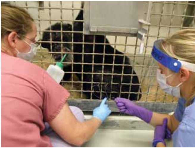
Figure 2. Chimpanzee J receiving acupuncture therapy for stifle osteoarthritis (acupuncture points from left to right: ST36, ST35, and ST34).