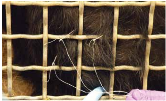
Figure 1. Three acupuncture needles inserted into regional stifle acupuncture points, with dental floss tied around needles to prevent loss of needles into chimpanzee enclosure.

Acupuncture procedure. We used sterile, disposable, uncoated surgical stainless steel hwa-to acupuncture needles (diameter, 0.25; length, 25 mm; Suzhou Medical Instruments, Jiangsu, China) that were 0.25 mm in diameter and 25 mm in length for our procedures. To avoid losing our acupuncture needles into the enclosure if an animal moved from its targeted position at the front mesh, dental floss was tied around each acupuncture needle that was placed in the animal (Figure 1). This practice ensured that the needles would pull free from the skin and stay with the veterinarian administering the acupuncture treatment if the animal pulled away from the front of the enclosure.