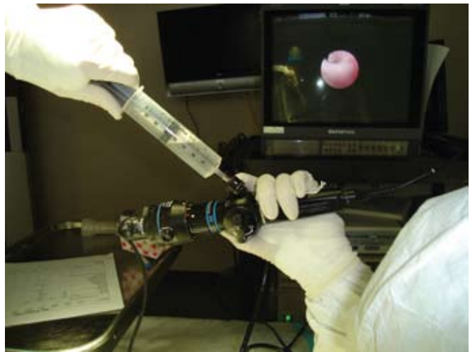
Figure 1. The conventional BAL (cBAL) procedure. The aspiration syringe is attached directly to the biopsy and suction channel of the bronchoscope. Note the awkward wrist position of the bronchoscopist holding the bronchoscope during aspiration.

Once the tip of the bronchoscope was seated, 2 aliquots of 25-ml physiologic saline at room temperature were introduced into the lung by 1 of the 2 instillation methods. Fluid was aspirated manually by using the syringe, either attached directly to the bronchoscope or to the tubing. All fluid was combined into a single pooled sample in a 50-ml conical centrifuge tube and placed on ice.