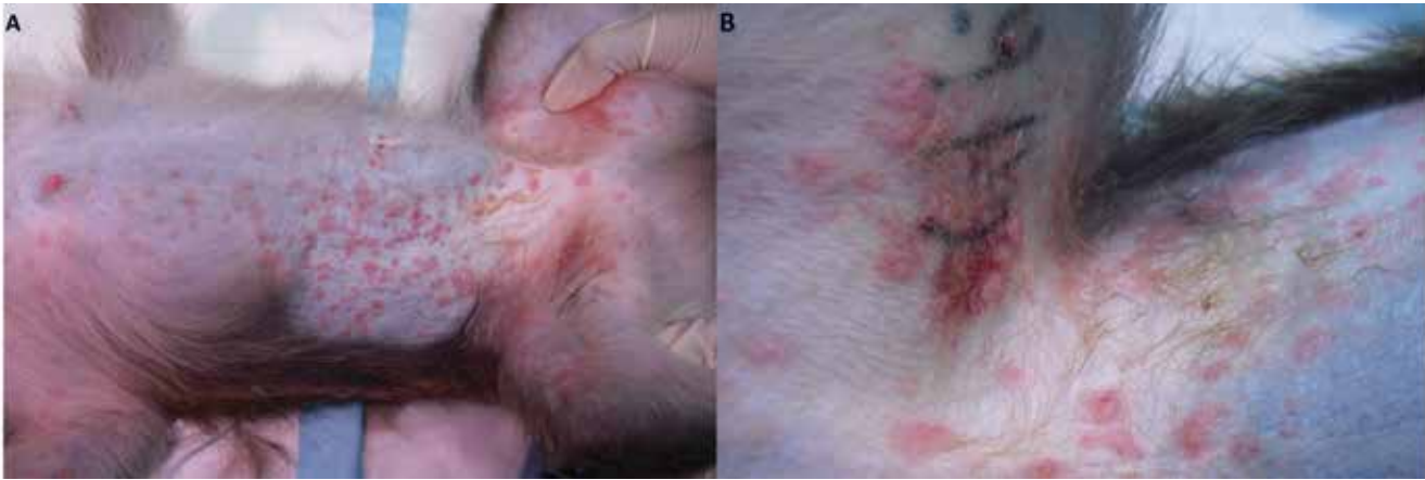
Figure 1. Cutaneous manifestation of a SSRI-associated adverse event in a cynomolgus monkey ( Macaca fascicularis ). Notice the (A) whole-body erythematous maculopapular dermatitis with (B) ecchymosis over the right inguinal region.

The subject was treated with a miconazole–chlorhexidine shampoo bath, diphenhydramine, and ketoprofen.