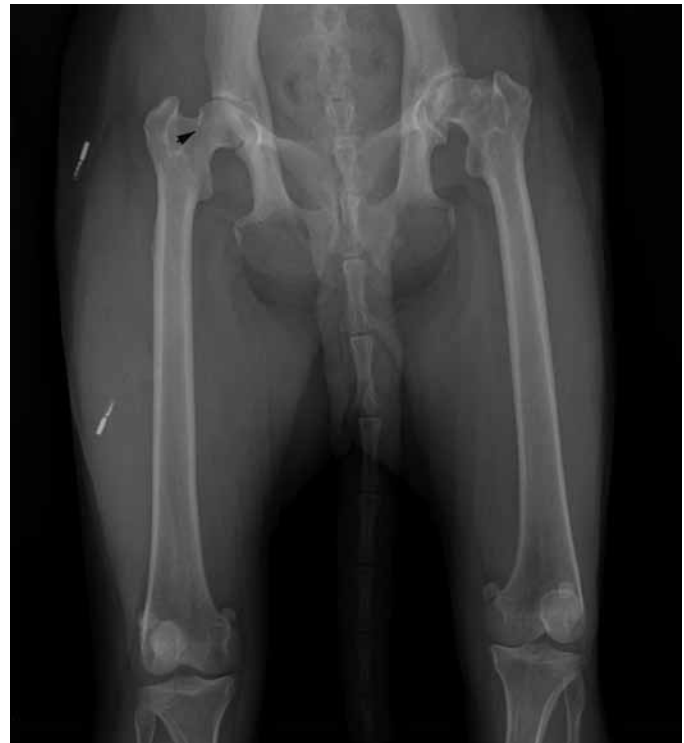
Figure 1. Preoperative radiographs demonstrating osteoarthritis of the left coxofemoral joint in a mature female rhesus macaque ( Macaca mulatta ). Remodeling of the femoral head, neck, and acetabulum is present along with subchondral bone sclerosis. Muscle atrophy in the left lower limb is apparent. Solid arrow indicates the Morgan line on the right femoral neck.

Physical therapy was performed under ketamine hydrochloride anesthesia and was initiated beginning 2 d postoperatively to minimize reduced range of motion in the coxofemoral joint. Therapy was continued 3 times weekly for 3 wk. Physical therapy consisted of full extension and flexion of the left coxofemoral and stifle joint, with the animal in right lateral recumbency. Each physical therapy session lasted for approximately 15 min. Nutritional support was administered via feeding tube at each physical therapy time point. After each physical therapy session, the patient was reunited with her social partner in her homecage after recovery from anesthesia. She was videotaped at 1 mo and 3 mo postoperatively to evaluate use of the surgically repaired limb.