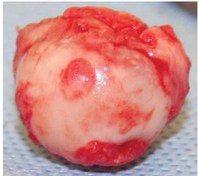
Figure 2. Excised femoral head demonstrating cartilage erosion and flattening of the femoral head.

Dual-energy X-ray absorptiometry was performed at 1 and 3 mo postoperatively to monitor postoperative progress by evaluating muscle mass of the surgically repaired hind limb.