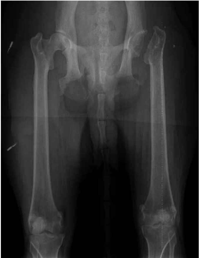
Figure 3. Postoperative radiographs demonstrating left coxofemoral joint after excision of the femoral head and neck.

Video recordings at 1 mo postoperative demonstrated full weight-bearing and, when compared with preoperative recordings, showed increased use of the left hindlimb, with ability to rotate the coxofemoral pseudointerjoint during normal postural adjustments. Recordings at 3 mo postoperatively revealed virtually no detectable difference in ambulation and movement between the 2 hindlimbs. Gait appeared normal, and the assessment at that point was that full function of the operated joint had returned. The 1- and 3-mo postoperative scans demonstrated an increase in total tissue mass and lean muscle mass of the left hindlimb. In addition, the total tissue mass and lean muscle mass of the right hindlimb (compensating limb) decreased during this time period, illustrating increased use of the affected limb (Figure 4). The video recordings and results from dual-energy X-ray absorptiometry demonstrate that our subject has not displayed some of the post-surgical complications that have been documented in companion animals, such as muscle atrophy, shortening of the surgically repaired limb, and reduction of hip extension. 10