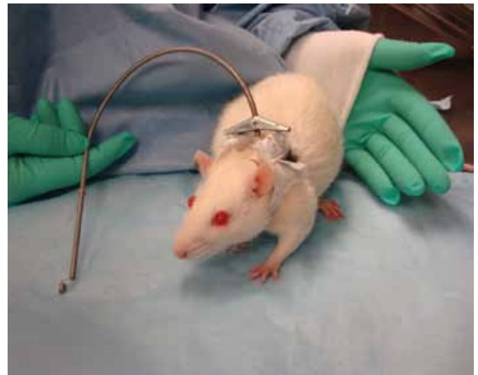
Figure 1. A rat in the jacket and tether system used in this project.

Animals. Male Sprague–Dawley rats (213 to 278 g on arrival) surgically implanted with jugular catheters were obtained from Charles River Laboratories (Portage, MI). Catheters were made of polyurethane tubing (inner diameter, 0.025 mm; outer diameter, 0.040 mm) and exited from the animal between the scapulae dorsally, where they could be connected to a tether and swivel system, to minimize the stress of handling while obtaining blood samples during the study. Sentinel animals for these rats tested negative for Sendai virus, pneumonia virus of mice, sialodacryoadenitis virus, Kilham rat virus, Toolan H1 virus, rat parvovirus, rat minute virus, reovirus, Mycoplasma pulmonis , rat theilovirus, lymphocytic choriomeningitis virus, hantaviruses, mouse adenovirus, Encephalitozoon cuniculi , cilia-associated respiratory bacillus, Bordetella bronchiseptica , Corynebacterium kitchneri , Salmonella spp. Streptobacillus moniliformis , Helicobacter spp., Klebsiella spp. ( pneumoniae , oxytoca ), Pasteurella spp. ( multocida , pneumotropica ), Pseudomonas aeruginosa , Staphylococcus aureus , Streptococcus pneu-