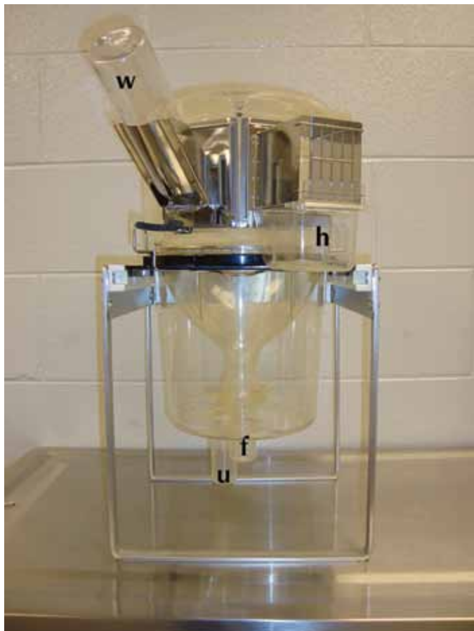
Figure 2. The metabolic cage used to house the rats in this project. The water bottle (w), food hopper (h), and urine and feces cups (u and f) are visible in this photo.

Experimental procedures. The experiments were conducted in 3 cohorts to allow for manageable numbers of rats to be sampled and tested during each study segment. Rats were allocated into the experimental groups (6 rats per group) comprising controls (no fasting) and 2, 4, 6, 12, 16, and 24 h of fasting. Groups in each cohort were as follows: cohorts 1 and 2, control rats and those experiencing 4-, 6-, 12-, and 16-h fasts; cohort 3, control rats and those experiencing 2- and 24-h fasts. Blood samples in volumes of either 0.7 mL (for CBC, chemistry, and corticosterone) or 0.1 mL (for corticosterone only) were taken from the catheter without removing rats from their cage. CBC and chemistry analysis were only performed at 0, 6, 16, and 30 h to limit blood loss due to sample collection and avoid interference with corticosterone measurements. Blood samples for corticosterone measurement were taken at 0, 2, 4, 6, 12, 16, and 24 h. Because of catheter failure, not all blood samples could be obtained from all rats at some time points. In these cases, hematologic parameters were analyzed with fewer animals per group; the smallest number of animals analyzed in any group was 4. Because of irreparable catheter failure, 2 rats had to be euthanized before completion of the study.