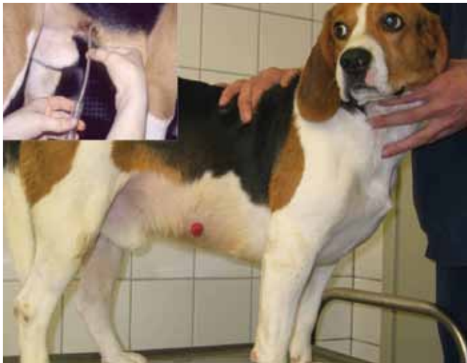
Figure 1. Intestinal sample collection from a conscious laboratory beagle dog with a jejunal fistula in the right flank. Adapted and reprinted with permission from reference 18.

consisted of commercial canned dog food (1.5 cans per dog; 400-g can, Pedigree, Fortivil, Waltham, Masterfoods, Helsinki, Finland) given twice daily. Water was freely available at all times. At the beginning of the study, the dogs were between 11 and 40 mo (mean, 18.50 mo) of age and ranged in body weight from 13.00 to 17.00 kg (mean, 15.02 kg). To determine the health status of the dogs, physical examinations were carried out, and blood samples were taken from each subject for hematologic and biochemical examinations. Before entering the study, the dogs were treated with fenbendazole (50 mg/kg PO for 3 consecutive days; Axilur, Intervet International, Boxmeer, The Netherlands), and fecal samples were collected afterward for endoparasite examination.